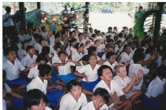
Song practice at St. Joseph's in Rarotonga

One of the MARIST MISSION projects we support is in the Diocese of Rarotonga in Fiji. They have rebuilt and refurbished St. Joseph's School which had been built of surplus World War II building materials that contained a lot of asbestos. Our monies helped with the rebuilding and presently funds are used for equipment, textbooks and supplies.