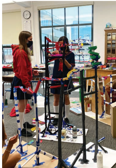
Classrooms with new air conditioners and ventilation