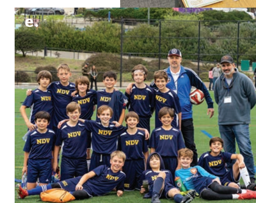
a. The Jesse tree b. Presidio field trip c. 2021 Decathlon d. Kindergarten class e. 6th grade CYO soccer players and coaches after a win