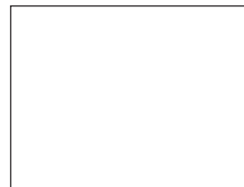
Graduating class of 2021 in Notre Dame des Victoires church