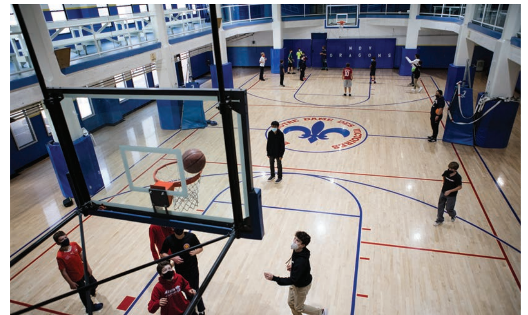
Newly resurfaced gym floor

Bank of America Clif Bar Genentech Golden Gate Capital Google Johnson & Johnson IBM Salesforce Wells Fargo