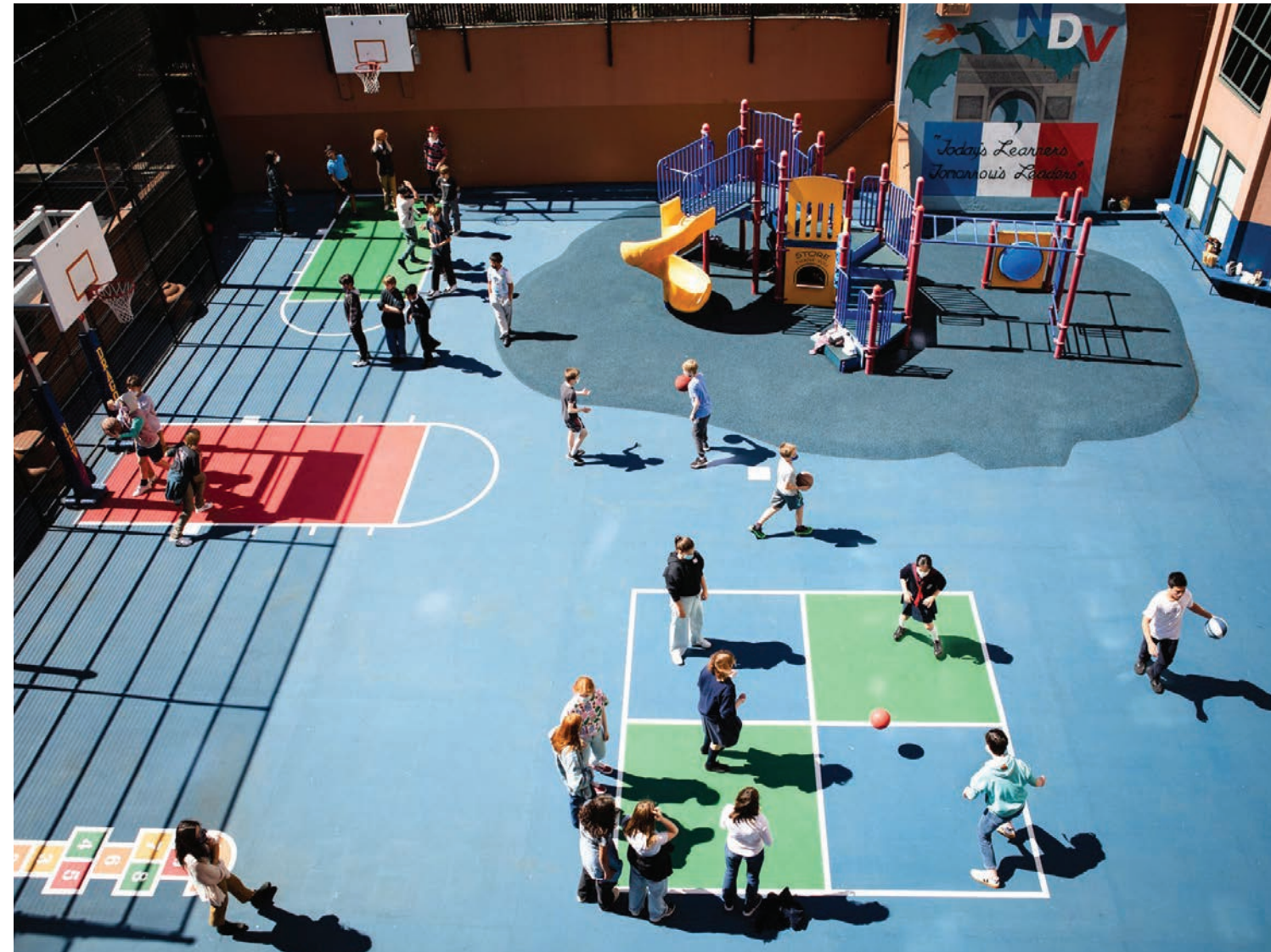
Completely renovated outdoor yard and play structure